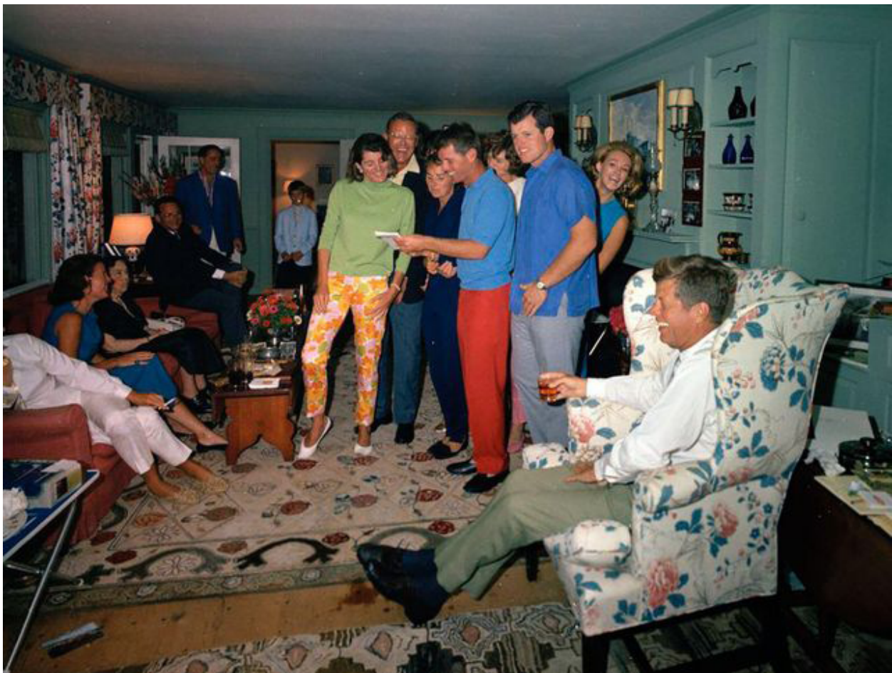
The Kennedy family at their compound in Hyannis Port, September 1963.