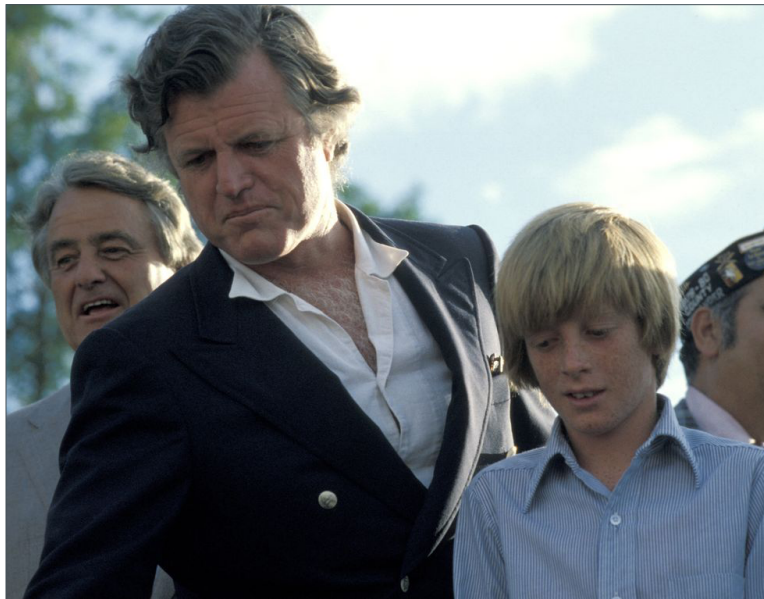
Ted Kennedy and son Patrick Kennedy in Brockport, New York, 1979.