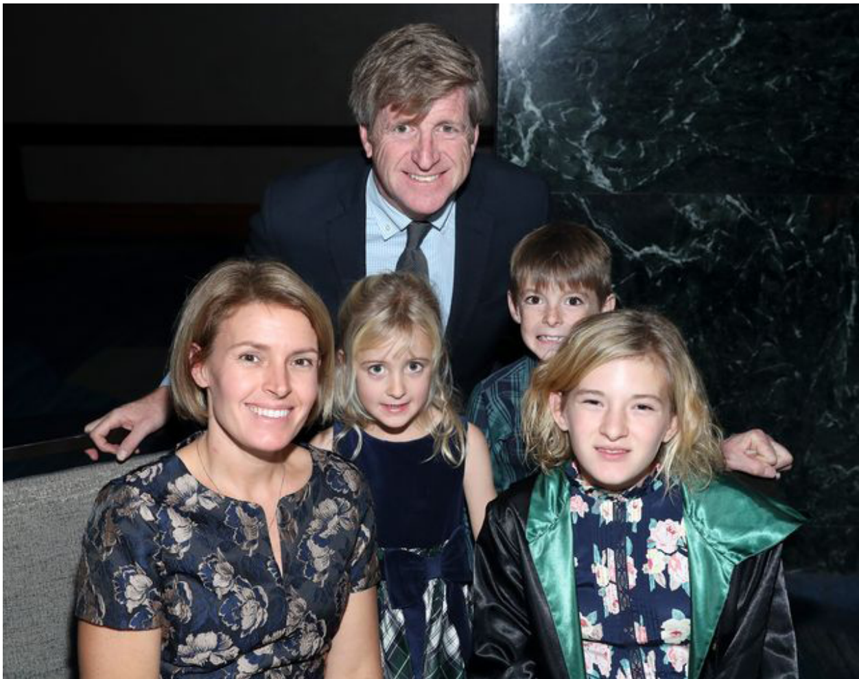
Amy and Patrick Kennedy and their family attend the Robert F. Kennedy Human Rights Hosts Ripple of Hope Gala in New York City, December 2019.

“It’s amazing: I wrote the Mental Health Parity Act, was part of all this great policy-making,” Patrick says about the bill he co-authored in 1996, which requires equal insurance coverage of treatment for mental illness and addiction. “But all people want to hear is me say, ‘I’m a drug addict and alcoholic, and I grew up in an alcoholic home and treatment can work.’”