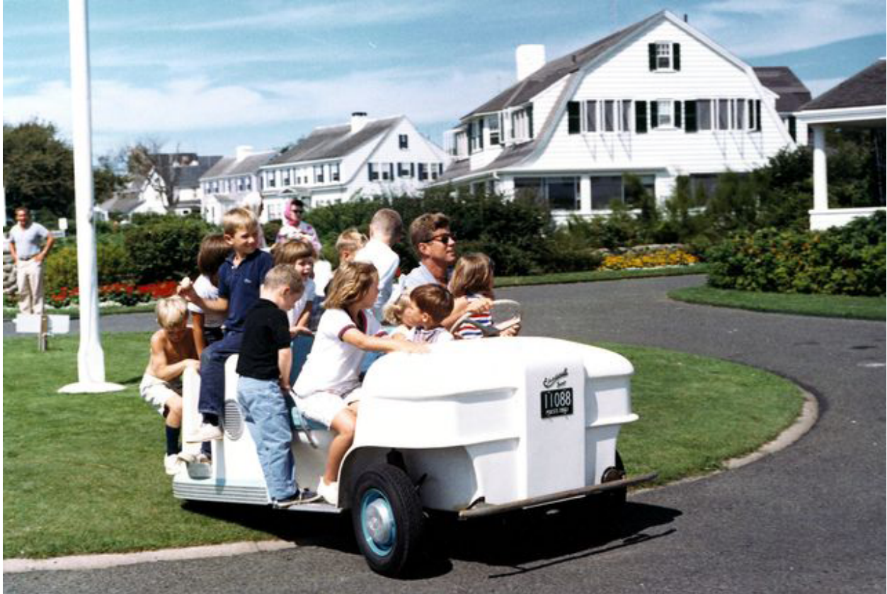
President John F. Kennedy and his family in Hyannis Port, Massachusetts in August 1962.